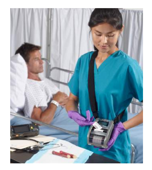
In healthcare, thermal printers are a vital means of identifying the right patient, medicine and specimen.

When businesses think of devices that require management, they think of smartphones, tablets, laptops, PCs and IoT devices. Thermal printers remain oddly absent, despite the fact that they are often connected to an IT network and are essential to the everyday operations of many industries.