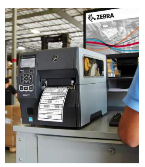
In manufacturing, as well as transportation and logistics, proper labeling can mean the difference between meeting or missing fulfillment deadlines.

With so many workers and workflows relying on thermal printers, it is critical that they always be available and performing as intended.