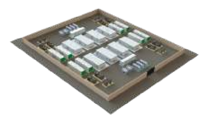
Figure 3 Example reference design as a starting point for building centralized or regional data centers

Similar to the large centralized data centers, regional data centers are typically designed with security and availability in mind. It is not uncommon to see Tier 3 designs in facilities like this. Sometimes prefabricated design approaches are deployed here, and reference designs are available as a starting point (see Figure 3 example).