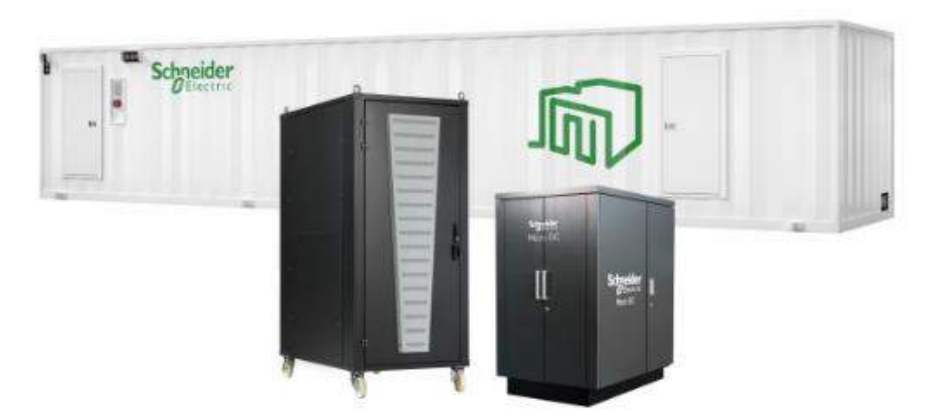
Figure 5 Examples of micro data centers by Schneider Electric

Examples of secured enclosures are shown in Figure 5. These are often pre-fabricated with all necessary support infrastructure included.