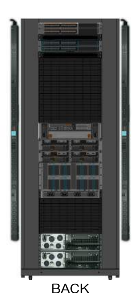
Figure 6 Example of a 1 rack micro data center with redundancy built in