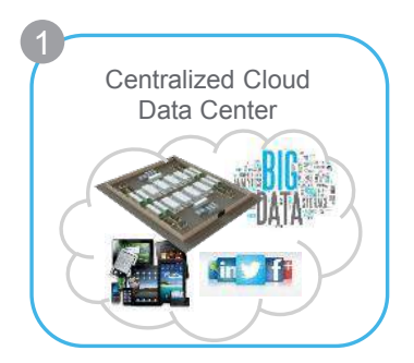
Figure 1 Data centers fit into one of three types. This paper focuses on the edge data centers.

In this paper, we'll describe the practices commonly seen in the three data center types mentioned above, discuss how the expectations of availability have changed, propose a method for evaluating the required level of resiliency for edge data centers (on-premise) to ensure business objectives are met, and describe best practices for implementing micro data centers on the edge.