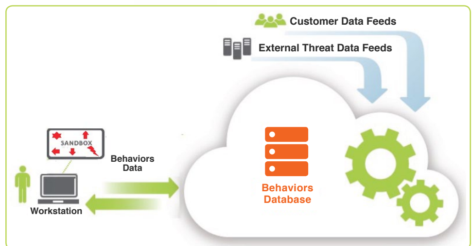
Figure 2: Behaviors are captured in a safe sandbox and compared against malware behavior patterns and rules.